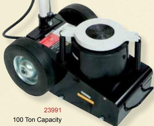
23991 100 Ton Capacity