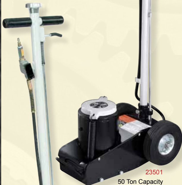
23501 50 Ton Capacity